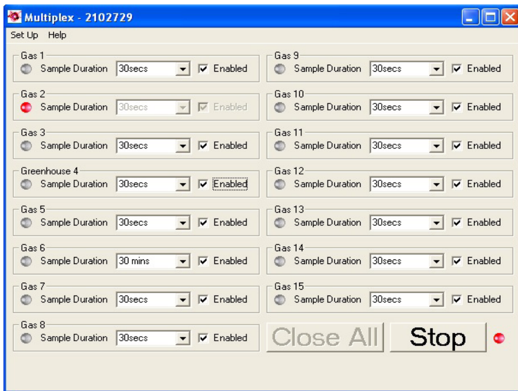
Multiplex running indicating channel 2 is currently being sampled.