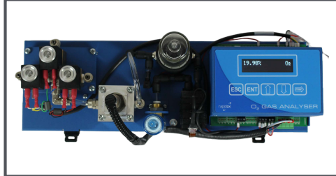
4 Rapidox 1100-OEM-RSB-ENC-ZR3-P (DIN rail mountable, 3-channel version with pump included)