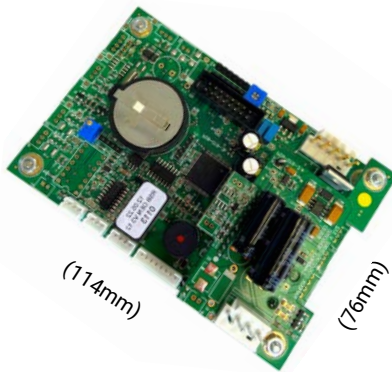
PCB only version without sensor block

The Rapidox 2100 OEM-RSB and 1100 OEM-RSB ranges of reliable, miniaturised, and high accuracy oxygen gas analysers are designed for use in today and tomorrow's Additive Manufacturing Industry.