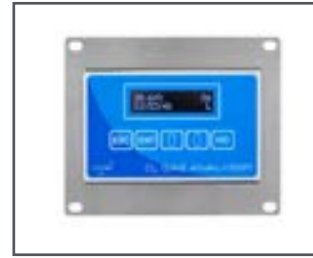
3 Rapidox 2100-OEM-INS (with panel mount option)