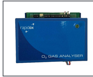
2 Rapidox 2100-OEM-ENC