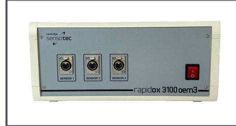
5 Rapidox 3100-OEM (3-channel, stacked multiplex for 3 sampling points)