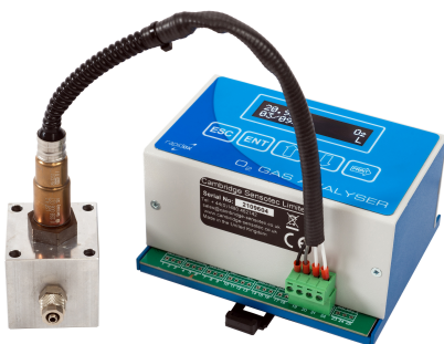
Aluminium encased version (INS) with display and sensor block

The Rapidox 2100 OEM-RSB and 1100 OEM-RSB ranges of products are actively used as a component in Additive Manufacturing (AM) machinery; 3-channel multiplex versions can be used in large machines, such as those used for Wire Arc Additive Manufacturing (WAAM), where several sampling points are required. The ranges are popular because: