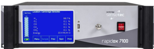
Rack mountable - Front and rear

The analyser will measure the gas composition providing % or ppm values for Hydrogen (H 2 ), Methane (CH 4 ), Carbon Dioxide (CO 2 ), Carbon Monoxide (CO) and Oxygen (O 2 ). It also has an optional upgrade to include a dewpoint sensor to measure the moisture content in the gas sample. With our bespoke design of the analyser, we can include a range of other sensors also if your production methods have any other gases which require monitoring. Our customer designed firmware for the analyser will also calculate and record the Gross Calorific Value (GCV) of the gas throughout the measurement.