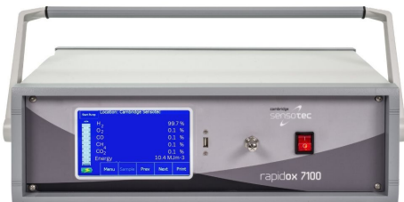
Benchtop - Front and rear

The Rapidox 7100 Blue Hydrogen (H 2 ) Analyser is a high specification rack mountable, or bench top instrument designed for the analysis and calculation of calorific value for hydrogen produced from biomass gasification, zero-CO 2 -emission methane pyrolysis, suitable either in a research laboratory or on-site.