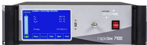
Rack mountable - Front and rear