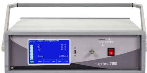
Benchtop - Front and rear

The Rapidox 7100 Green Hydrogen (H 2 ) Analyser is a high specification rack mountable, or bench top instrument designed for the gas analysis, dewpoint measurement and calculation of calorific value for hydrogen produced from the electrolysis of water, suitable either in a research laboratory or on-site.