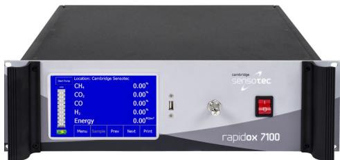
Rack mountable - Front and rear