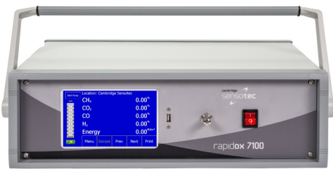
Benchtop - Front and rear

The Rapidox 7100 Syngas Analyser is a high specification benchtop or rack mountable instrument designed for the analysis and calculation of calorific value for syngas produced from the gasification of waste material at high temperature in an environment low in oxygen, either in a research laboratory or on-site.